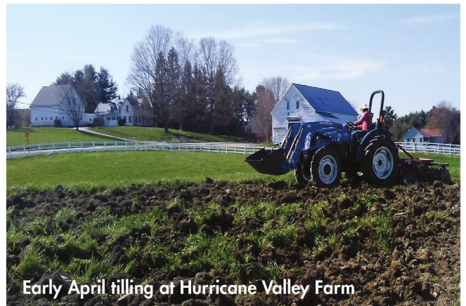
Early April tilling at Hurricane Valley Farm

Please enjoy a hike on the designated trails or join our farm tour later this summer (look for an announcement in August). And save the date for our Harvest Party taking place on Thursday, September 27, which is a great opportunity to enjoy the farm with others who support the vision of protecting open space in Falmouth.