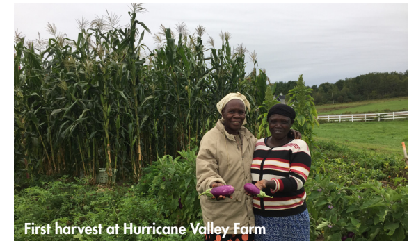
First harvest at Hurricane Valley Farm

In its first growing season, the Hurricane Valley Farm produced approximately 11,000 pounds of locally grown produce for families in Maine. This amount of food represents a milestone for our community as well as the Hurricane Valley Farm project, which has a long-term vision to develop sustainable agriculture over the next decade. The 62-acre property was purchased by the Falmouth Land Trust in 2015. Next year, our partner, Cultivating Community, anticipates adding additional garden plots to the community gardening area, expanding the number of participating farmers and developing a small apiary program for honey and pollination. This past summer, Cultivating Community had four farmers working at the Hurricane Valley Farm growing vegetables for markets in their farmer training program, which will also be expanding in the future. The trails at HVF are open to people who wish to take a walk or run on the property.